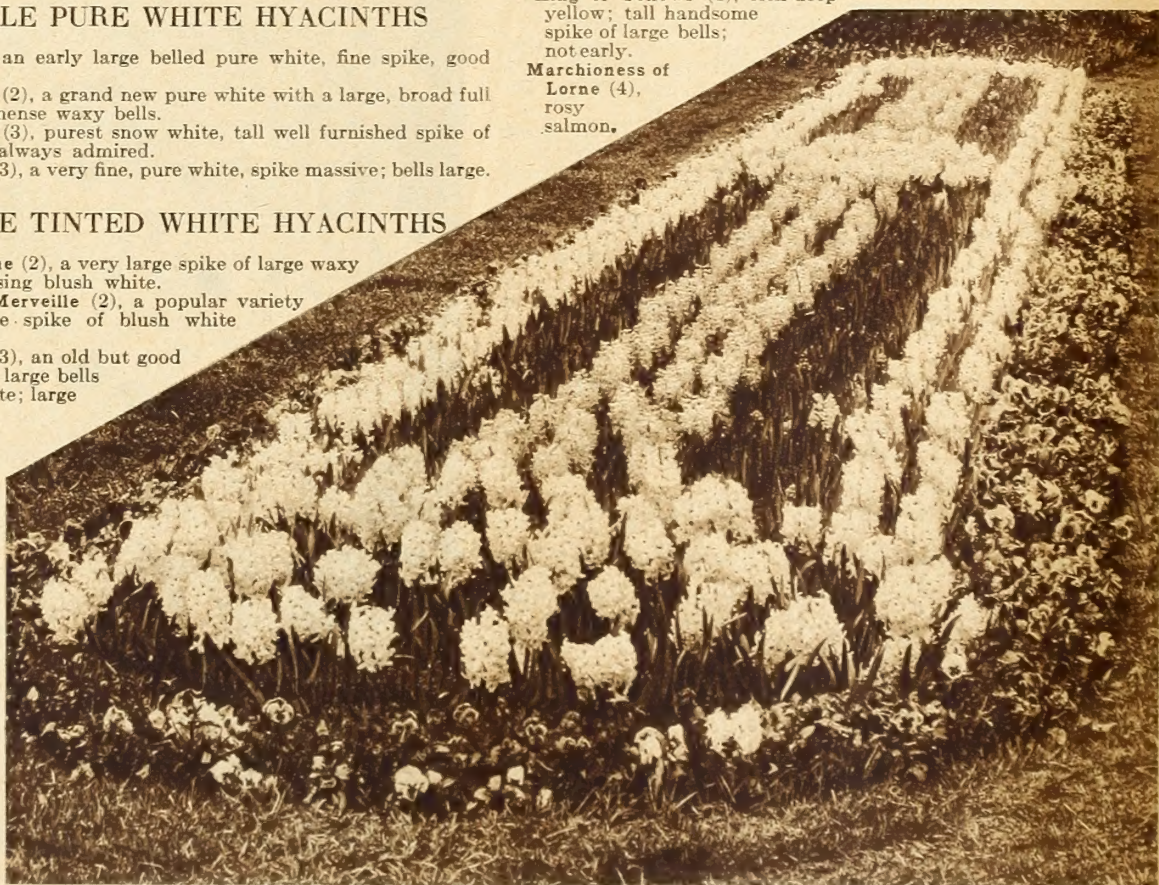
A BED OF HENDERSON'S NAMED DUTCH HYACINTHS